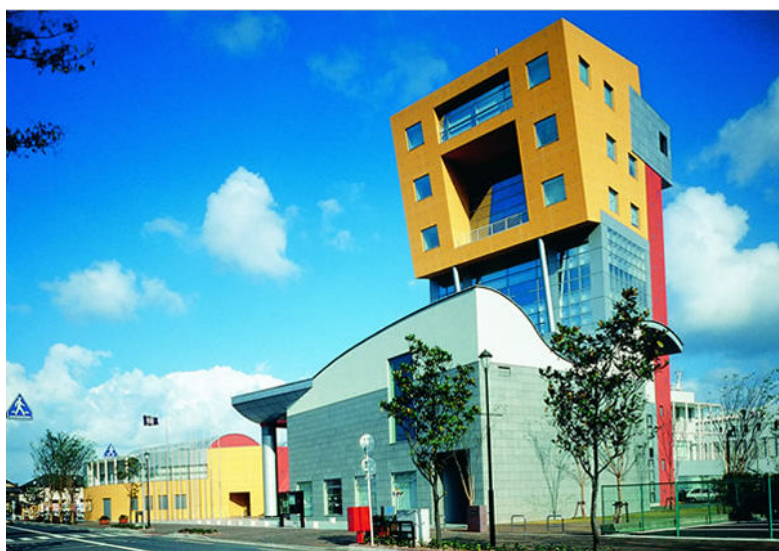
Kitakyushu International Conference Center

http://www.agoda.com/pages/agoda/popup/popup_areamap.aspx?1=1&area_id=483071&area_name=Kokura&country_id=&city_id=88744&city_name=Kitakyushu&latitude=33.841049&longitude=130.893601&PopupSize=80&asq=gFH8gcqAcjR%2bwXCO14iyw%3d%3d